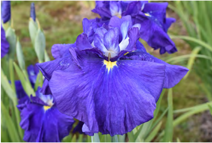
(above): Rhythmic Blues (Harris, 2026) Japanese iris