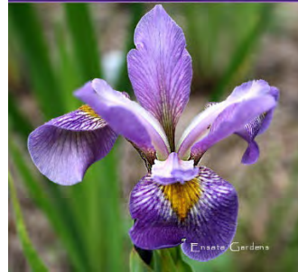
Blue Splatter (Rudkin 2009) Cajun Serenade (H. Nichols 2008) Contraband Girl (I. virginica)