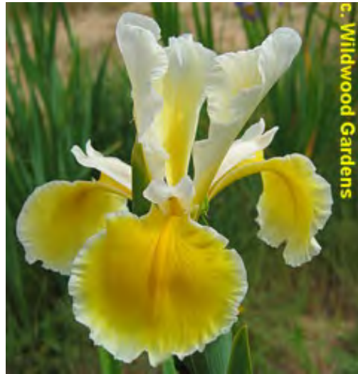
left top: All Gothed Up (Schafer/Sacks 2020) SIB