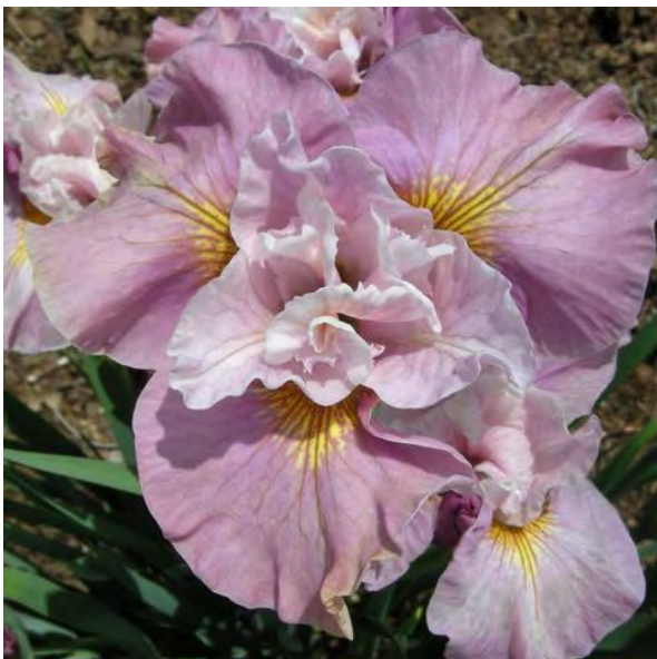
bottom right: Sakuragawa (prob. Shoo before 1856) Japanese