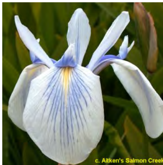
Blue Rivulets (Harris 2013) laevigata