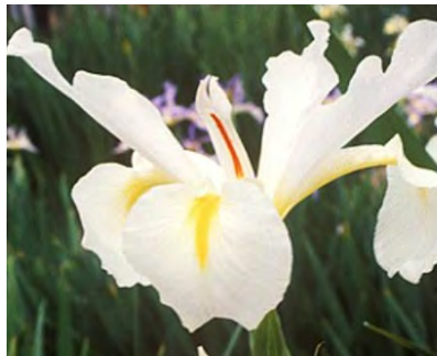
right top: Oregon Cream (Walker 2008) spuria